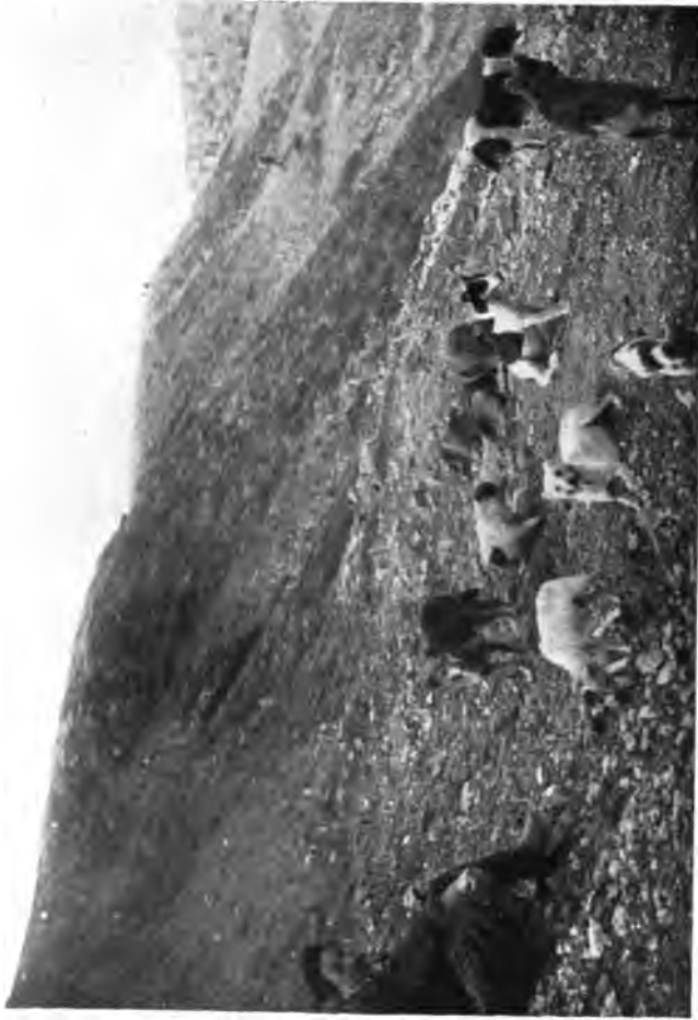
ONE PROBLEM SOLVED (The once-famous dogs of Constantinople, now destroyed)